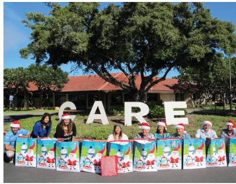
The Andaz Resort Maui elves pose for a quick photo with their delivery in front of Hale Makua Kahului.

Residents and staff love the holiday season. It's filled with entertainment, festive decorations, children, wonderful food and an abundance of love. This year was made extra special thanks to two organizations that went above and beyond to make sure our residents had an especially memorable Christmas.